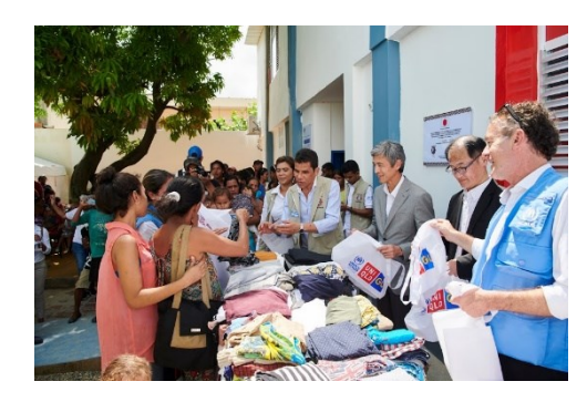
Clothing donation by Fast Retailing (UNIQLO and GU)