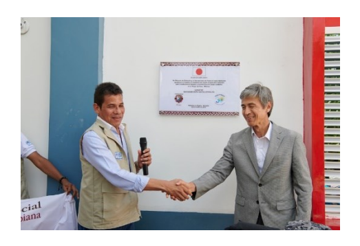
Official hand over at the Maicao Refugees and Migrants Centre of the Pastoral Social

Infrastructure expansion Furniture, fans, and electric appliances Clothing Donation