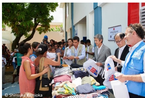
Clothing donation by Fast Retailing (UNIQLO and GU)