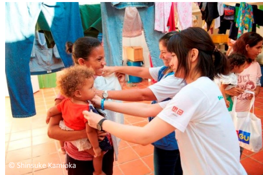
Clothing donation by Fast Retailing (UNIQLO and GU) at the Cúcuta 's Migration Centre