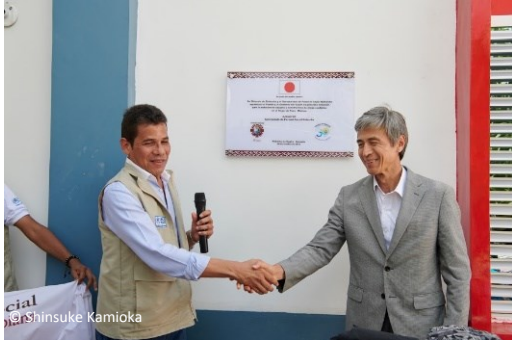
Official hand over at the Maicao Refugees and Migrants Centre of the Pastoral Social