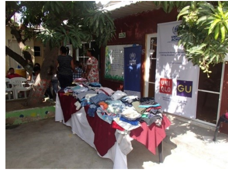
Clothing donation by Fast Retailing (UNIQLO and GU) at the ICBF in Riohacha