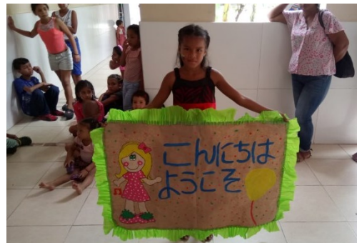
Official hand over at the Cúcuta's Migration Centre of the Scalabrini Corporation