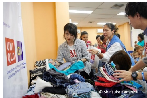
Clothing donation by Fast Retailing (UNIQLO and GU) at the Nuestra Señora de los Remedios Hospital in Riohacha