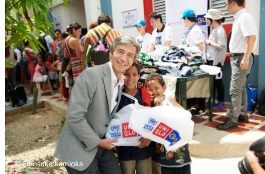
Clothing donation by Fast Retailing (UNIQLO and GU)