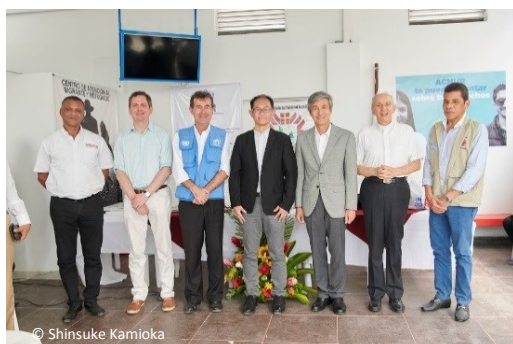
Official hand over at the Maicao Refugees and Migrants Centre of the Pastoral Social