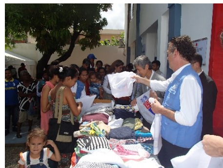
Clothing donation by Fast Retailing (UNIQLO and GU)