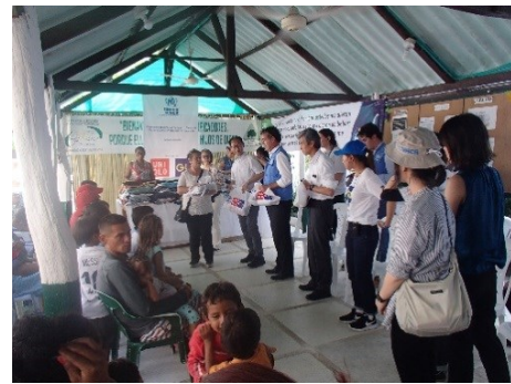
Clothing donation by Fast Retailing (UNIQLO and GU) at the Casa del Abuelo in Riohacha